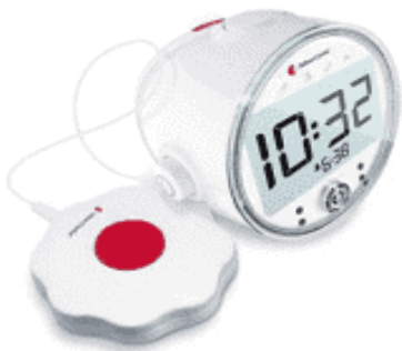
Bellman & Symfon Visit Alarm Clock

One lady had recently bought one and she expressed her satisfaction with this model. When it's time to get up the Visit Alarm Clock wakes you with a sounding alarm, flashing lights and vibrations from the bed shaker which is placed beneath your pillow. If you have other compatible products e.g. doorbell, smoke alarm, phone or baby monitor, they can also be connected to the Visit Alarm Clock which will then wake you up if activated.